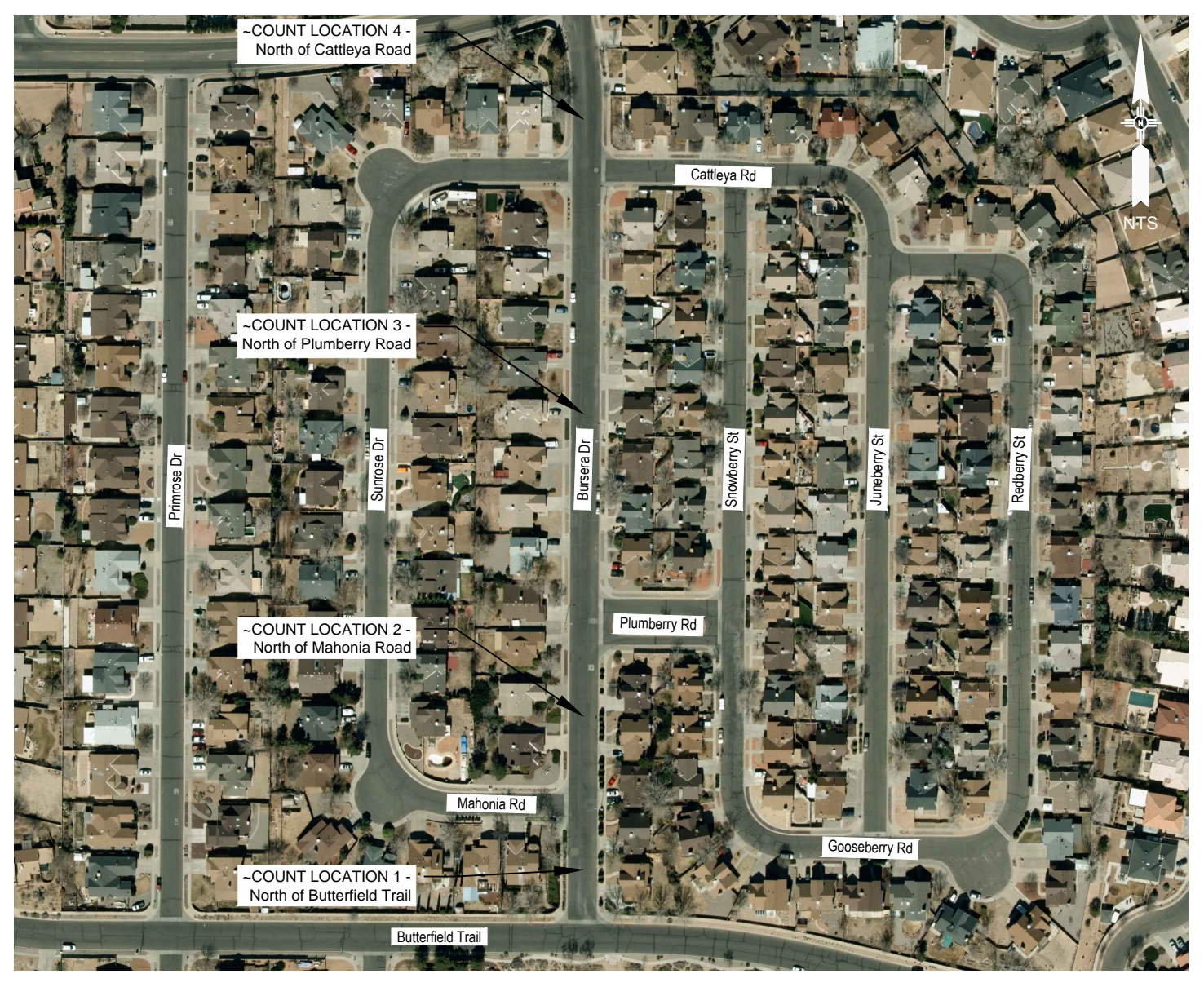
FIGURE 2.1. COUNT LOCATIONS